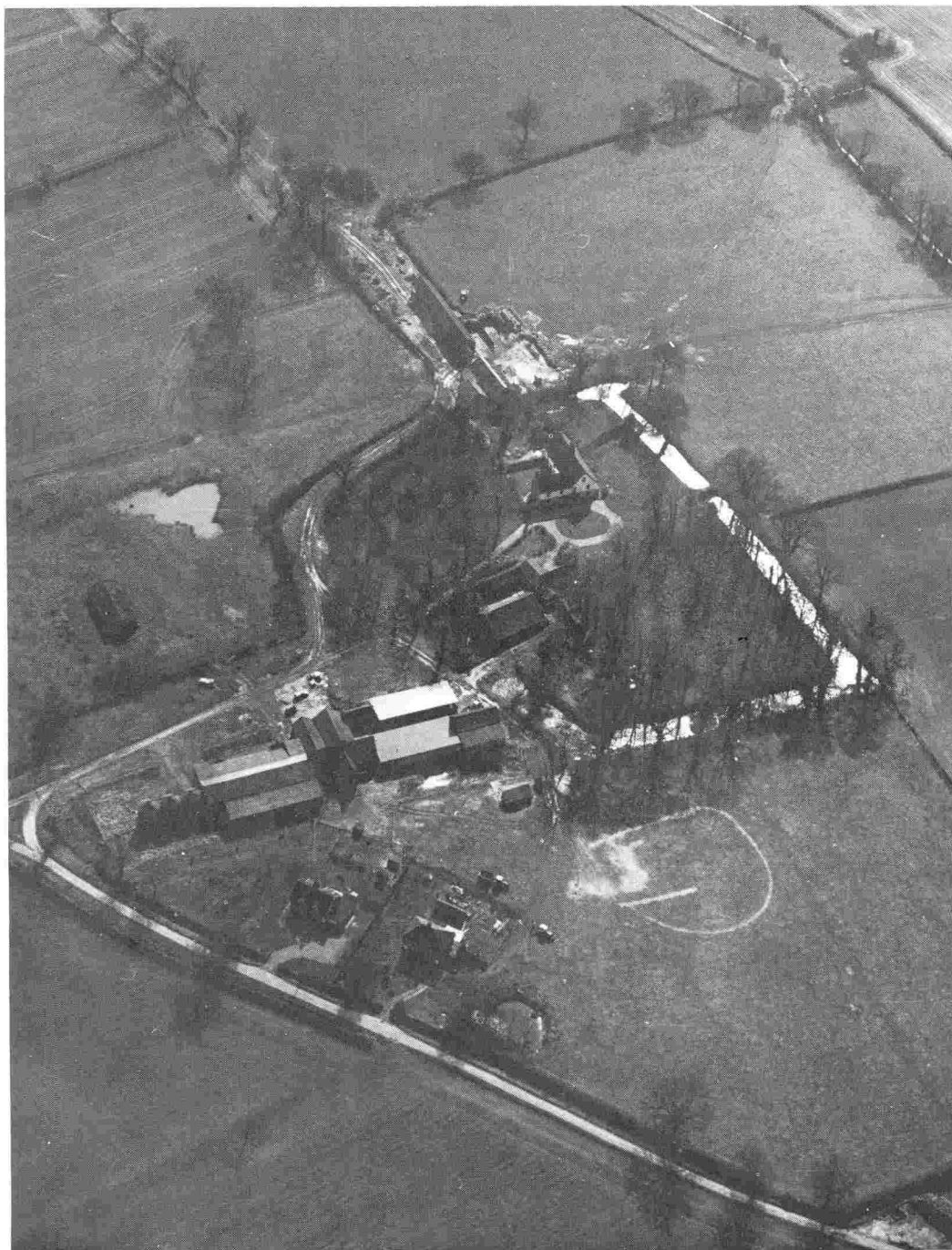
Aerial view of South Elmham Hall within its quadrangular moat, from the north, 1986.

EXCURSIONS