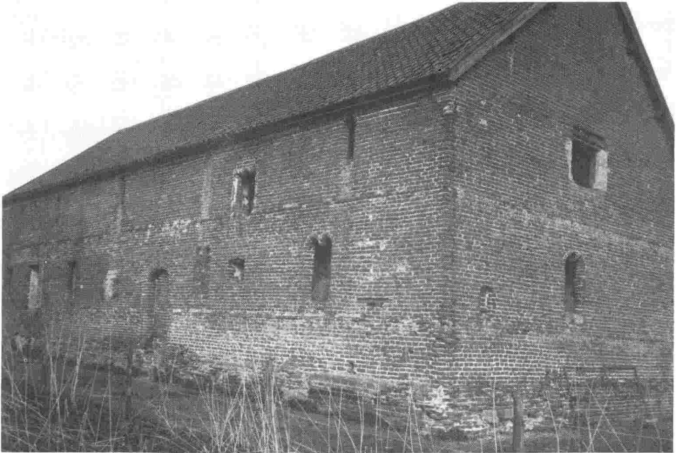
Eye Priory Guesthouse, brick-built, c. 1500: west and south faces.