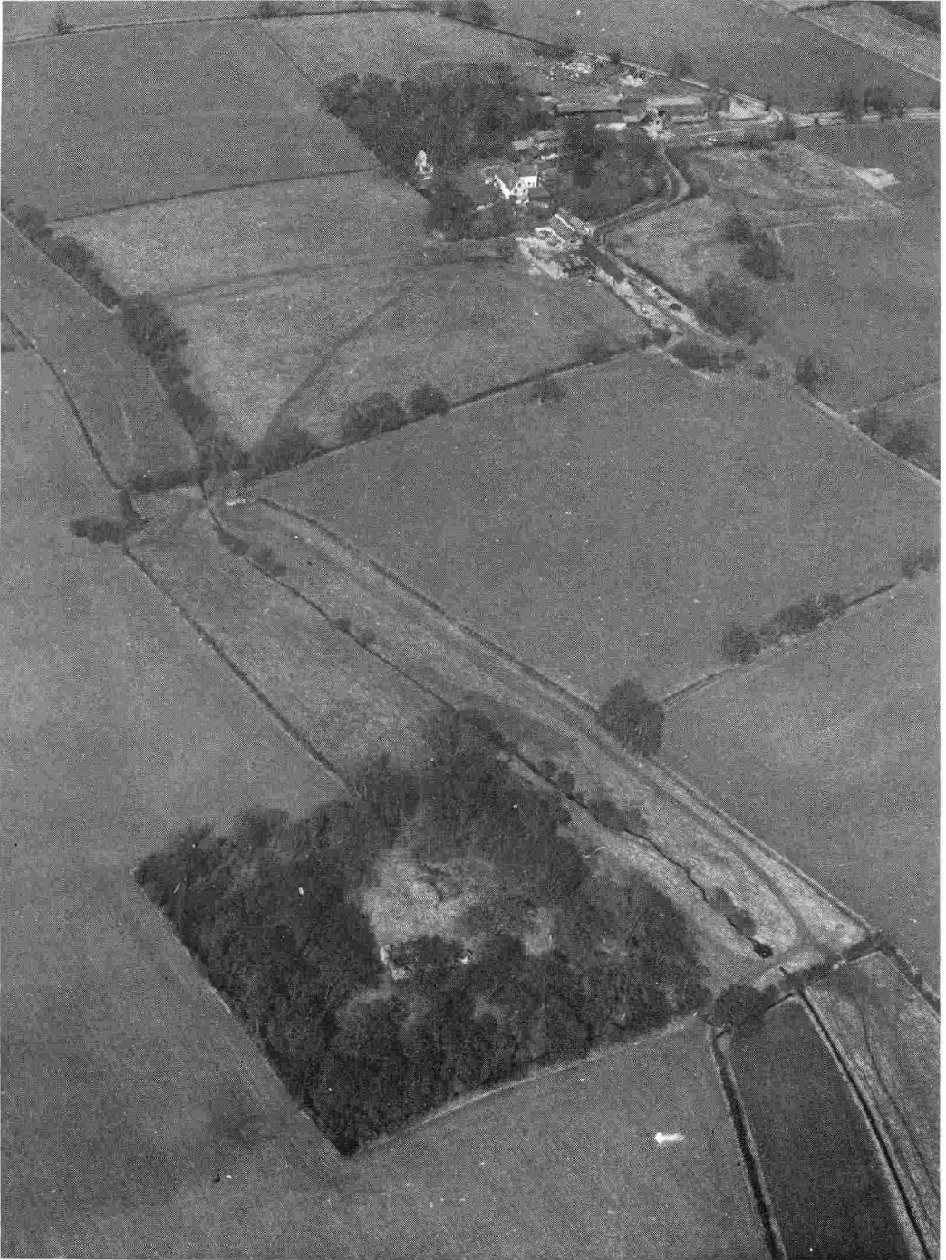
Aerial view of South Elmham Minster and the Hall, from the south, 1986.

EXCURSIONS