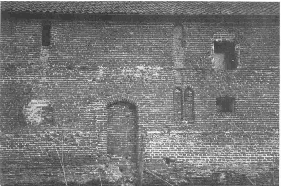
Eye Priory Guesthouse, brick-built, c. 1500: detail of west face.